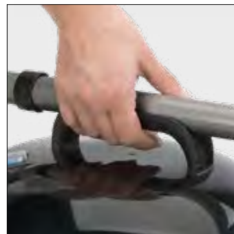
Convenient Carry Handle