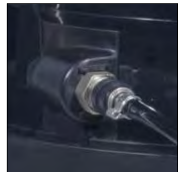
Quick Release Cleaning Liquid Connector