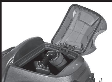
Large opening to the 19.2 gal (73 L) recovery tank allows easy cleaning