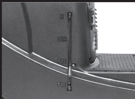
Water solution level indicator with volume visible on the tank