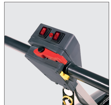
Simple Operator Controls