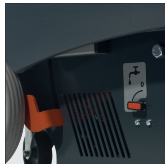
Adjustable Water Flow