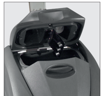
Overfill Cut-off System